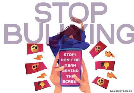
Design by Lola Y6