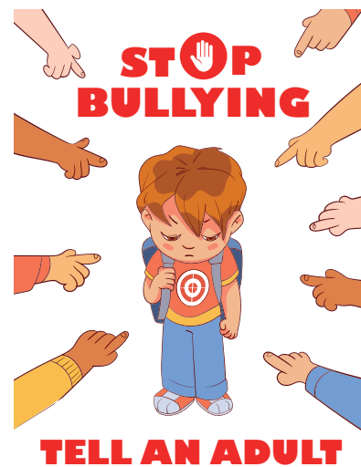
Design by Seth Y1