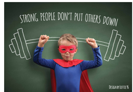
DESIGN BY LOTTEE Y6