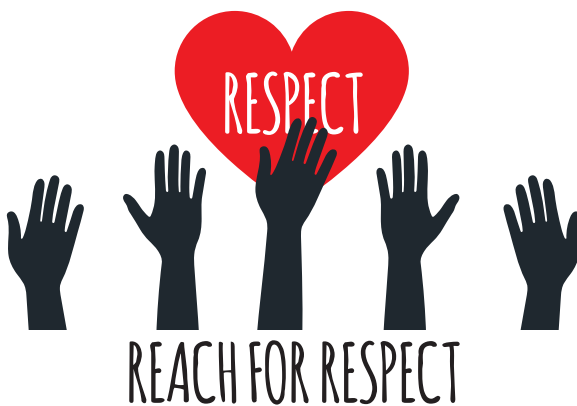
DESIGN BY SAVANNAH Y6