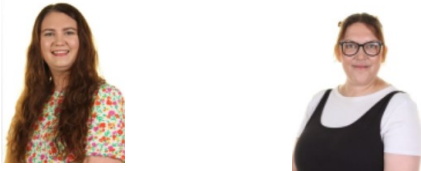
Year 4 Teaching Assistants